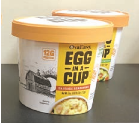
Egg in a Cups are available in three flavors and are the equivalent of two shelled eggs.

Products include whole egg crystals in a variety of sizes, available in both cans and pouches. Egg in a Cup is filled with egg crystals that equal two eggs. Add one-half cup of water, microwave one minute, and breakfast is served.