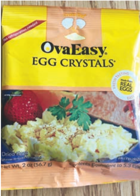
This two-ounce pouch of OvaEasy Egg Crystals is the equivalent of five shelled eggs. Instructions on the back of the pouch show how much water to add for the number of eggs desired, then cook as you would a regular egg.

Egg white protein powder is available in resealable bags or single-serve bags. Single-serve keto shakes are available in two flavors and are designed as a meal replacement, with the equivalent of six egg whites per serving.