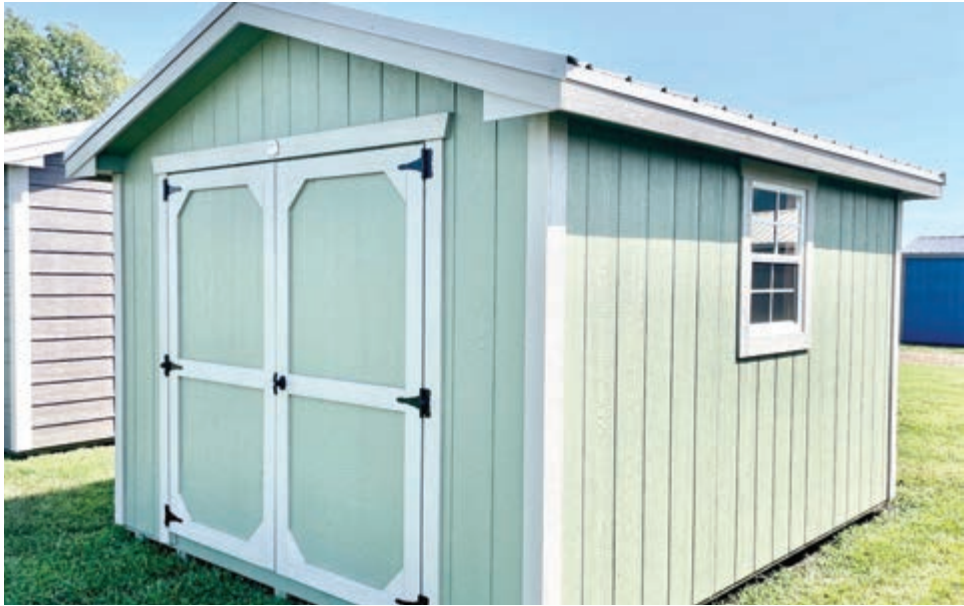
SPECIAL TO PANORA TIMES

A shed similar in size to this one has been donated by Sunrise Sheds for the Tori's Angels Gala live auction. The winning bidder will be able to have it customized and also can upgrade to a larger size for an additional fee. Sunrise sheds can be used to store boating equipment, garden tools or general items; as a party house, she-shed or man cave; or a chicken coop or dog run.