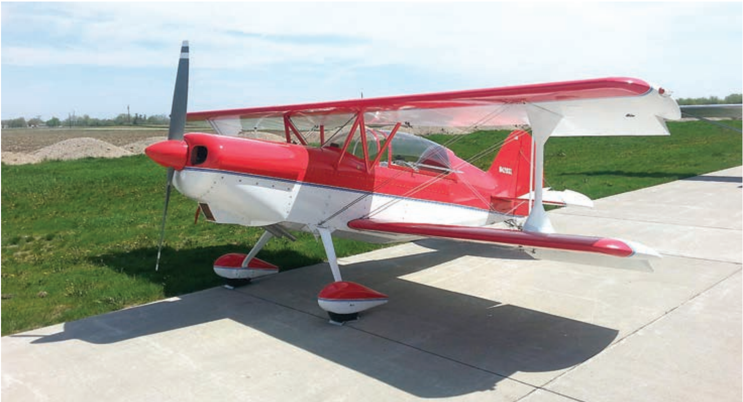
A homemade plane that just keeps flying year after year.

Regarding the finished plane, Jorgensen said, "It's a steel tube structure for the fuselage, which is all welded together. The wings are all fabricated out of wood, and then it's covered with fabric. It's a big job to