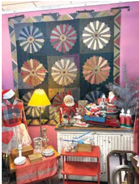
A 19th century quilt and other assorted items from Reborn.