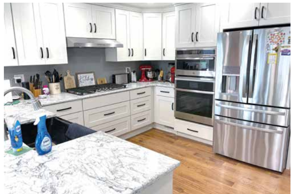
Stainless steel appliances coordinate perfectly with the granite countertops and white cabinetry in the Reynolds’ kitchen.

The main improvements they’ve made over those years include adding a living