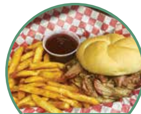
SMOKED PULLED PORK SANDWICH