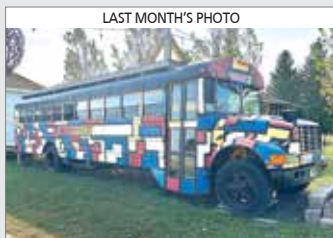
LAST MONTH'S PHOTO

The answer to last month's photo is a school bus painted to resemble one from the 1970s TV show "The Partridge Family." The bus is located at Badd Bones Gallery and Studio in Bagley. Have a guess on where the object in this month's photo is? Have one to submit for future issues? Send to shane@dmcityview.com . ■