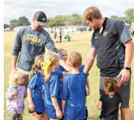
SUE BUMP | SPECIAL TO THE TIMES VEDETTE

The club will have registration for the Spring 2024 season in January, use Facebook for promotion, and send home fliers with the elementary kids at Panorama and ACGC. Waddle said they hope to get a simple website up before then for those who don't use the social media