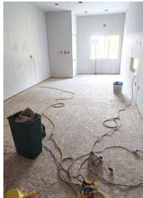
Sheetrock was up, and the sub-floor was ready.