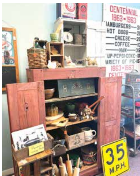
Memories can be found in every direction at Reborn in Panora.