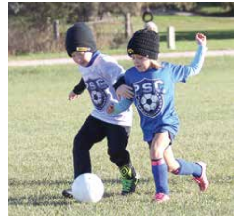
JAIME WADDLE | SPECIAL TO PANORA TIMES

In the Panorama Soccer Club, U5 and U6 (Under 5 and Under 6) are combined, as are U7 and U8. The teams are co-ed, and every attempt is made to assure that each team has an equal number of boys