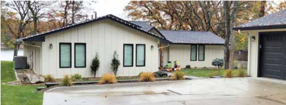
Paula Wachholtz, 6884 Panorama Drive