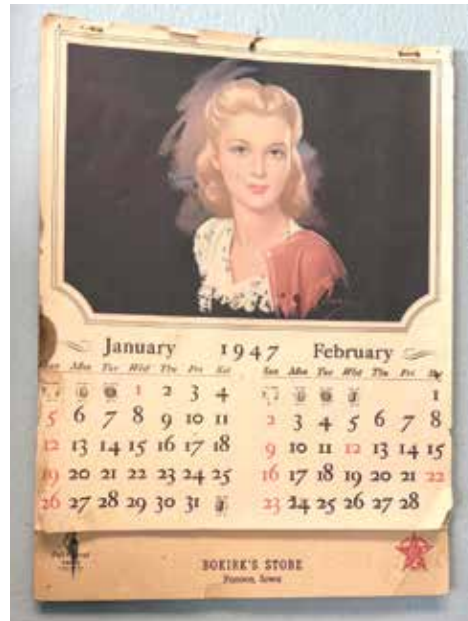
A 1947 calendar from Bokirk's store in Panora.

not only antiques but are of local interest including calendars, clocks and photos from decades of Panora's history.