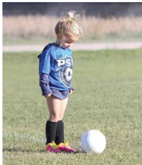
JAIME WADDLE | SPECIAL TO PANORA TIMES