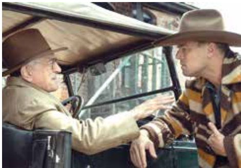
“Killers of the Flower Moon”

and with his resume, you can make a 3.5-hour movie and get it released in theaters. The guy has directed some of the greatest films in the history of cinema. This, by the way, is not one of them. It is dreadfully long and very, very sad. DeNiro and DiCaprio are excellent, but the young woman (Lily Gladstone) who plays the lead in the film steals the show. Ultimately, it depicts not one of our proudest chapters