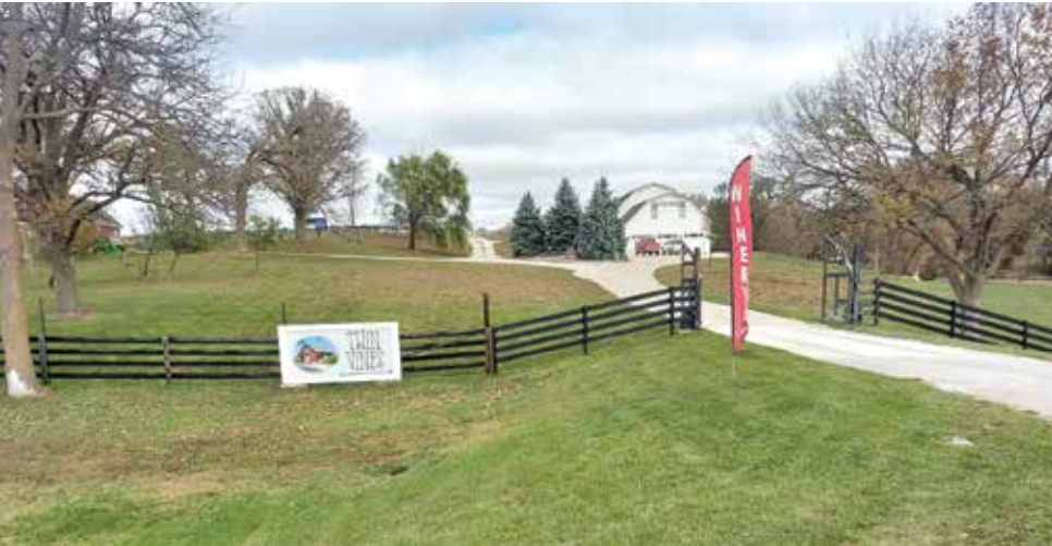
Twin Vines Vineyard, 2824 Highway 44

WFPF members help decorate the Panora town square for Christmas and run the candy cane walk and cake walk during community events. They donate cookies for Memorial Day activities and the Haunted Village; clean the roadside ditches on Highway 4 north of Panora twice a year; hold two annual blood drives; donate money to several local organizations; and purchase Christmas presents for Panora Specialty Care residents. The group meets the second Tuesday of each month and welcomes new members. ■