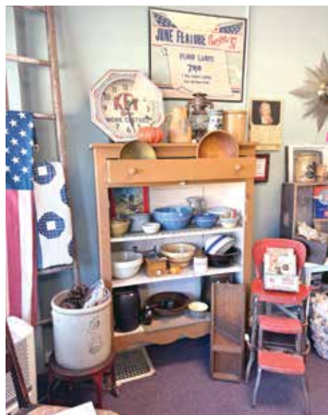
Many of the antiques for sale were everyday items just a few decades ago.