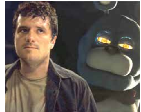
"Five Nights at Freddy's"

as Americans. Still, it is a good film and worth seeing in the theater if you've got half a day. Grade: B+